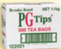
PG Tips Squares 500s