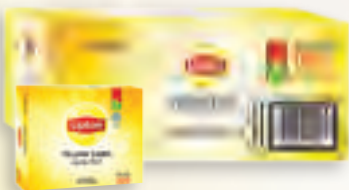
Lipton Yellow Label Quality Black Envelope Tea Cup Bag 1000s

Choose your brand, flavour and format to suit your resident's dining experience