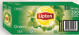
Lipton Green Envelope Tea 300s