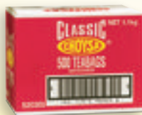
Choysa Squares 500s