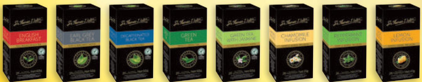
Sir Thomas Lipton range in 8 variants

Sir Thomas Lipton has an extensive range for both residents and guests to enjoy at whatever time of day and according to their preference.