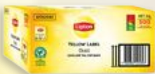
Lipton Yellow Label Gold Envelope Tea Cup Bag 500s

Lipton tea available in black and green variants with foiled envelopes to ensure a fresh cup of tea every time.