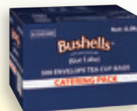
Bushells Blue Label Tea Cup Bag 500s