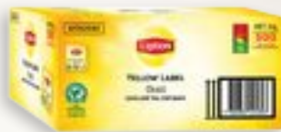
Lipton Yellow Label Gold Envelope Tea Cup Bag 500s