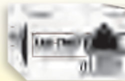
Lan-Choo Tea Pot Bag 1000s