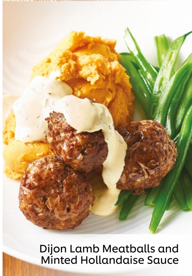
Dijon Lamb Meatballs and Minted Hollandaise Sauce