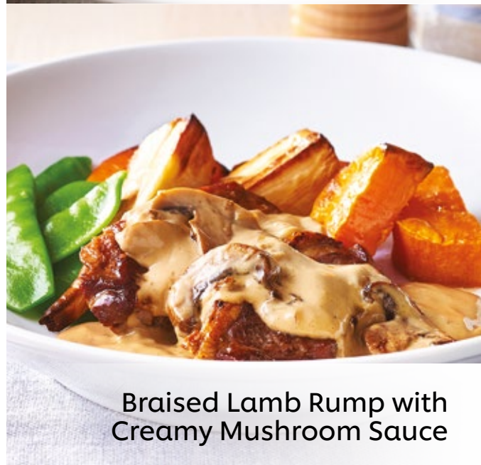
Braised Lamb Rump with Creamy Mushroom Sauce