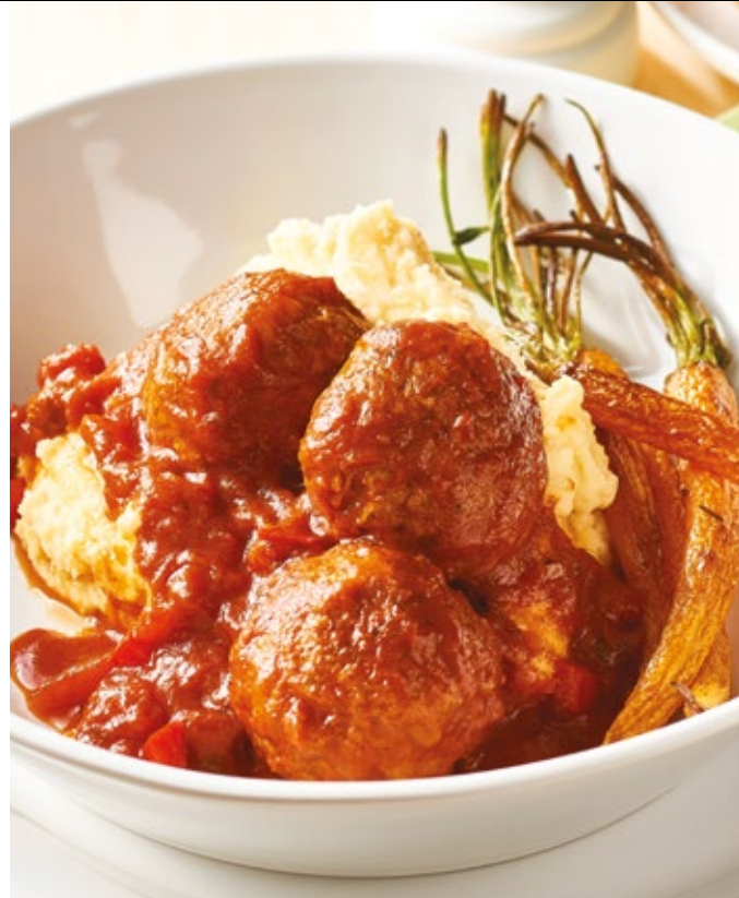
Moroccan Lamb Meatballs