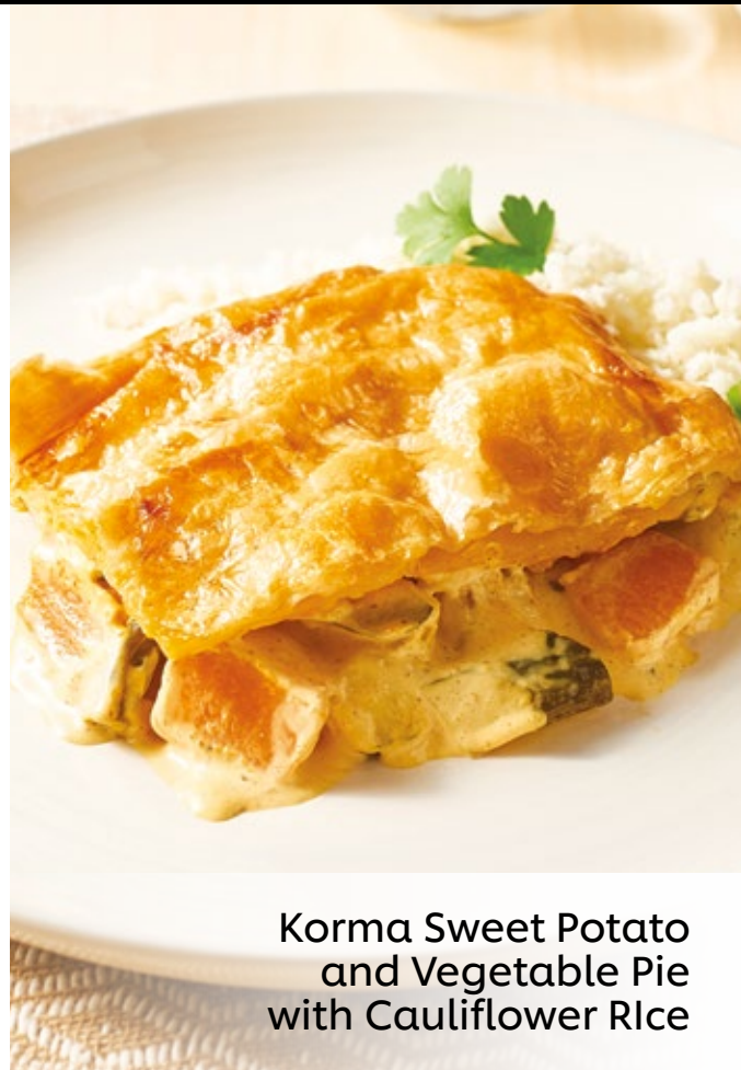
Korma Sweet Potato and Vegetable Pie with Cauliflower Rice