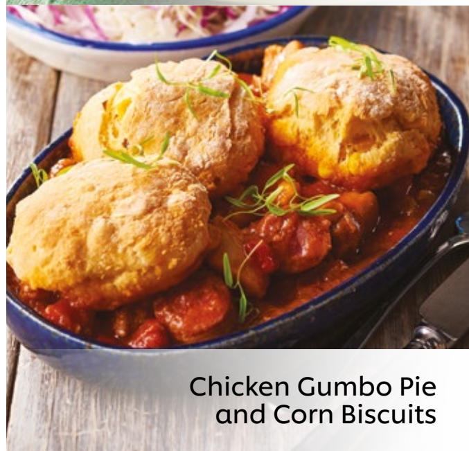
Chicken Gumbo Pie and Corn Biscuits