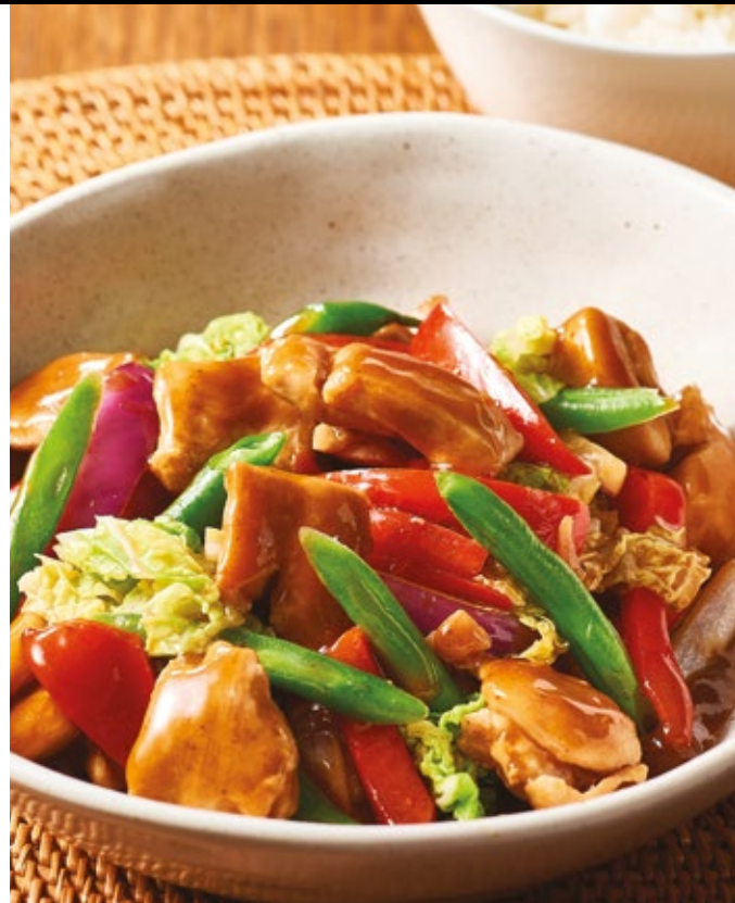
Honey Garlic Chicken Stir Fry