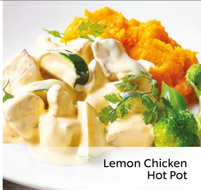
Lemon Chicken Hot Pot