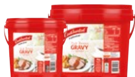
Continental Rich Brown Gravy 1.8kg/6kg