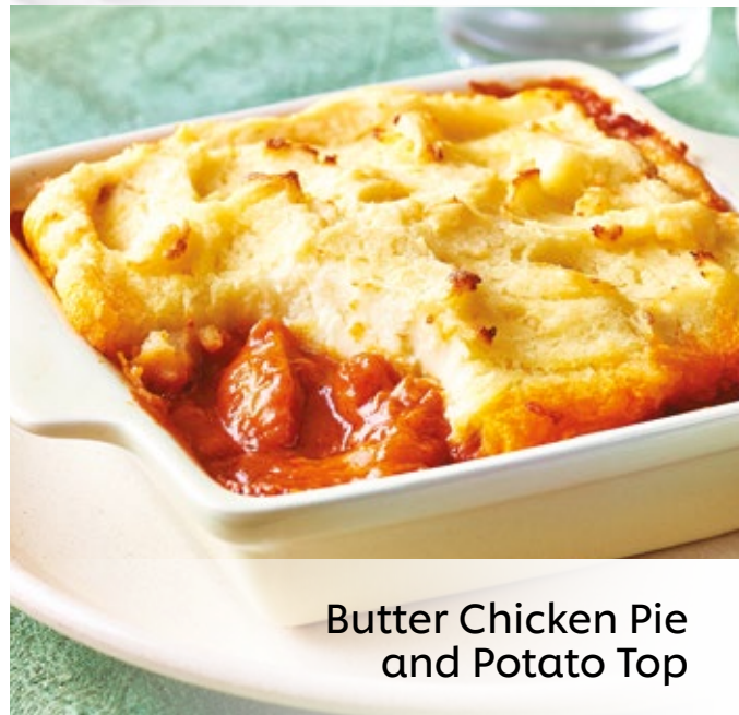
Butter Chicken Pie and Potato Top