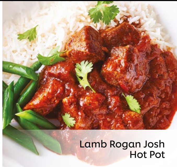
Lamb Rogan Josh Hot Pot