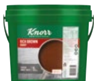
Knorr Rich Brown Gravy 7.5kg