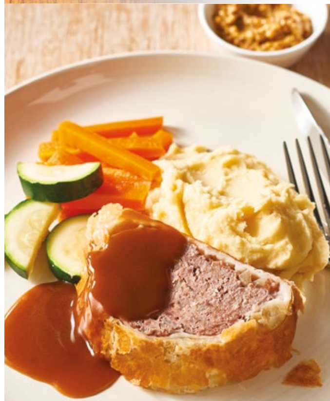
Lamb Meatloaf Wellington with Wholegrain Mustard Gravy