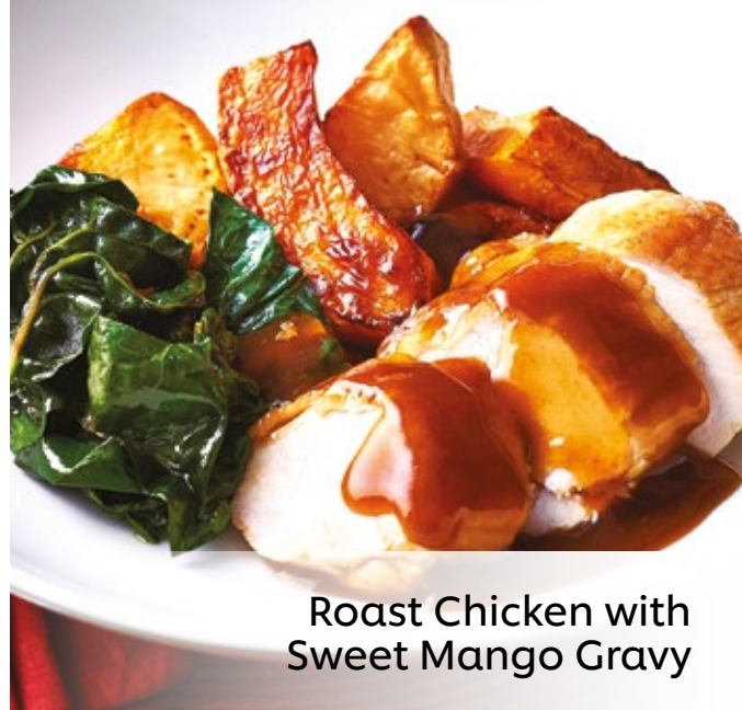
Roast Chicken with Sweet Mango Gravy