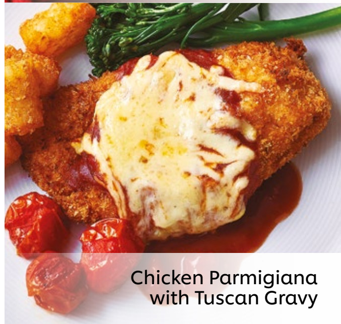
Chicken Parmigiana with Tuscan Gravy