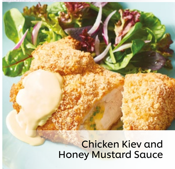
Chicken Kiev and Honey Mustard Sauce